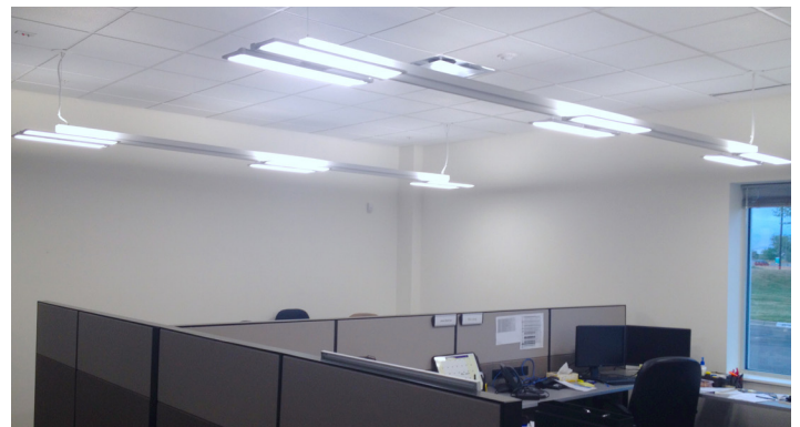
Edge-Lit LED luminaires produce direct and indirect light for an overall brighter space.

As LED designs become more fine-tuned, more extensive testing is also required. For traditional luminaire